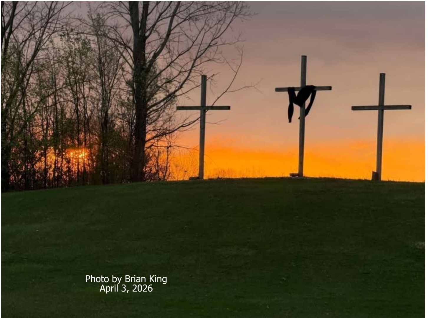
April 3, 2026