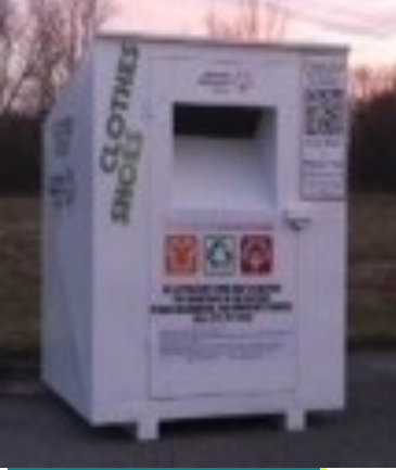
Clothes recycling bin that helps Special Olympics.

The white collection bin next to our paper recycling bin on the south parking lot is for clothes and shoes.